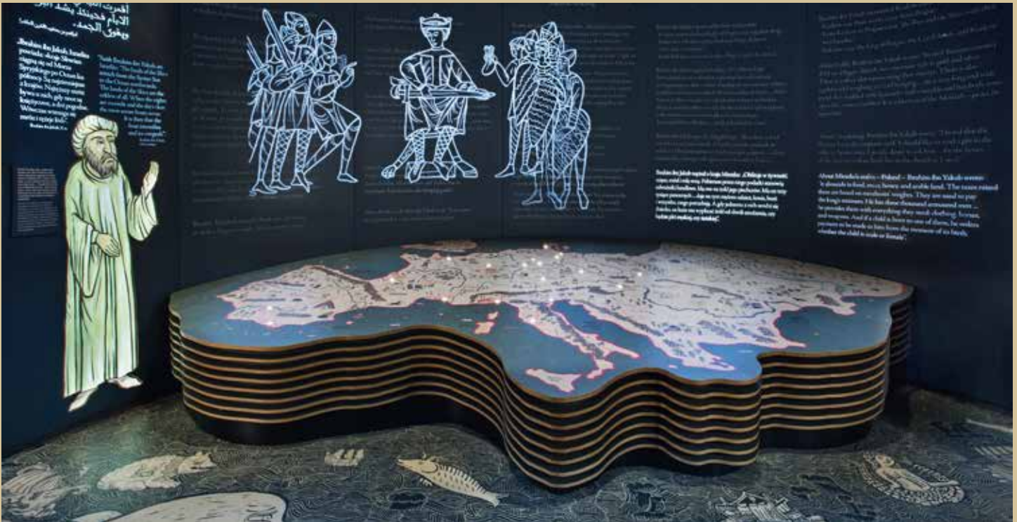
The First Encounters Gallery (960-1500) includes the story of Ibrahim ibn Yakub, who visited Polish lands in the tenth century. His written account is an early source that mentions Jewish trade in Poland.

agents of history, and not only objects onto which others projected their fantasies and fears.