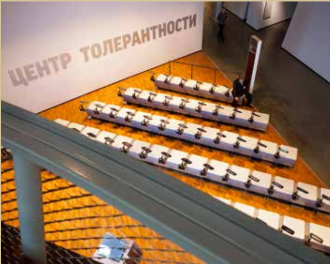
Tolerance Center, which holds interactive classes for students

The World War II Hall exemplifies these themes. As compared to many Jewish museums, the topic of the Holocaust does not prevail. There is a special room to commemorate all the victims of the war, of both Jewish and non-Jewish origin. What is emphasized is the contribution of Jews in the victory of the Red Army, since victory in particular defines the attitude of the Russian people to World War II.