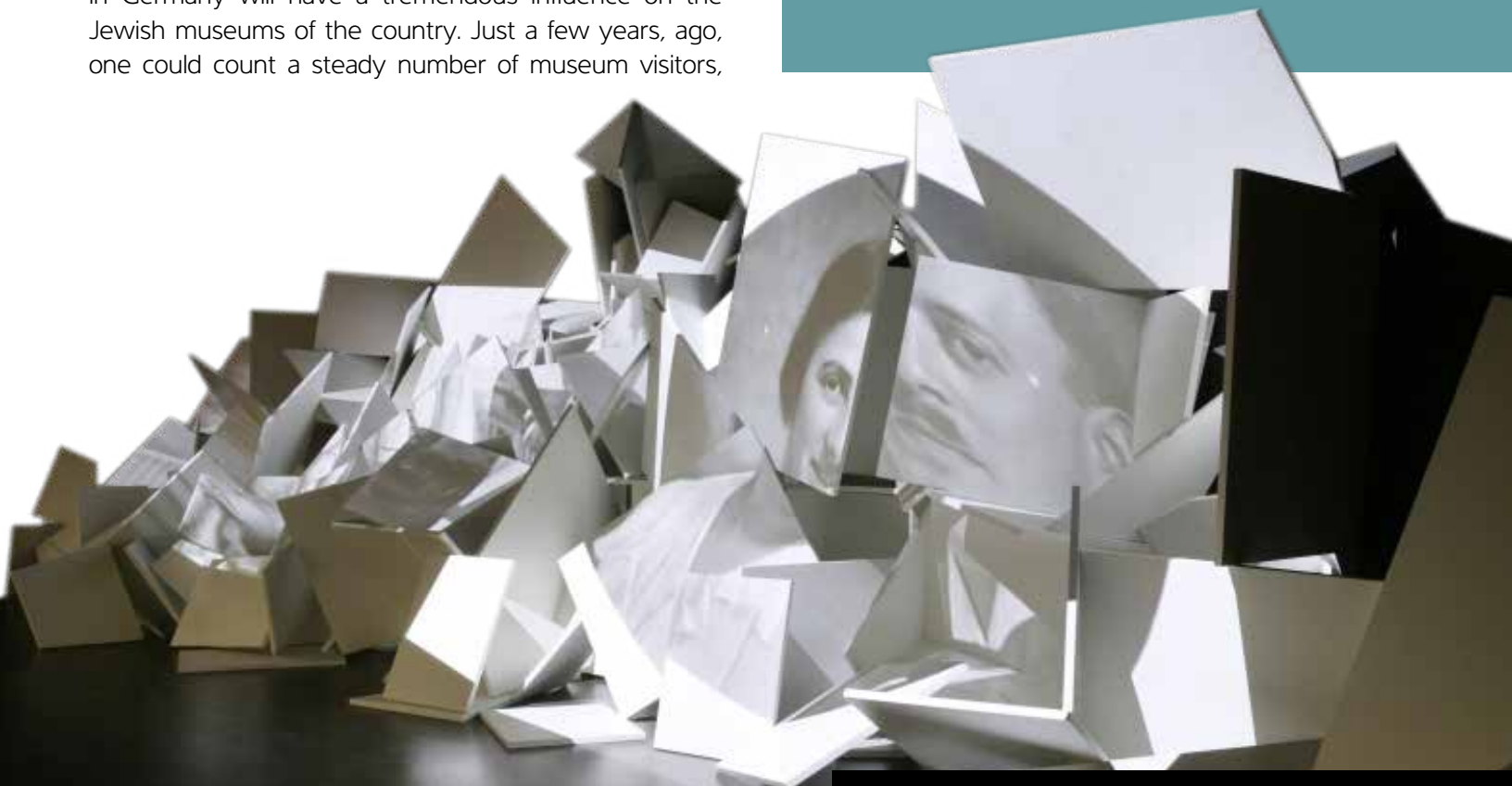
Special exhibition: “Home and Exile (Jewish Emigration From Germany Since 1933),” projection of emigrés on broken glass.

In a Jewish museum, the question of defining a “Jewish object” is not always easy. For one thing, the attribution “Jewish” is not necessarily self-evident and is often ambiguous.