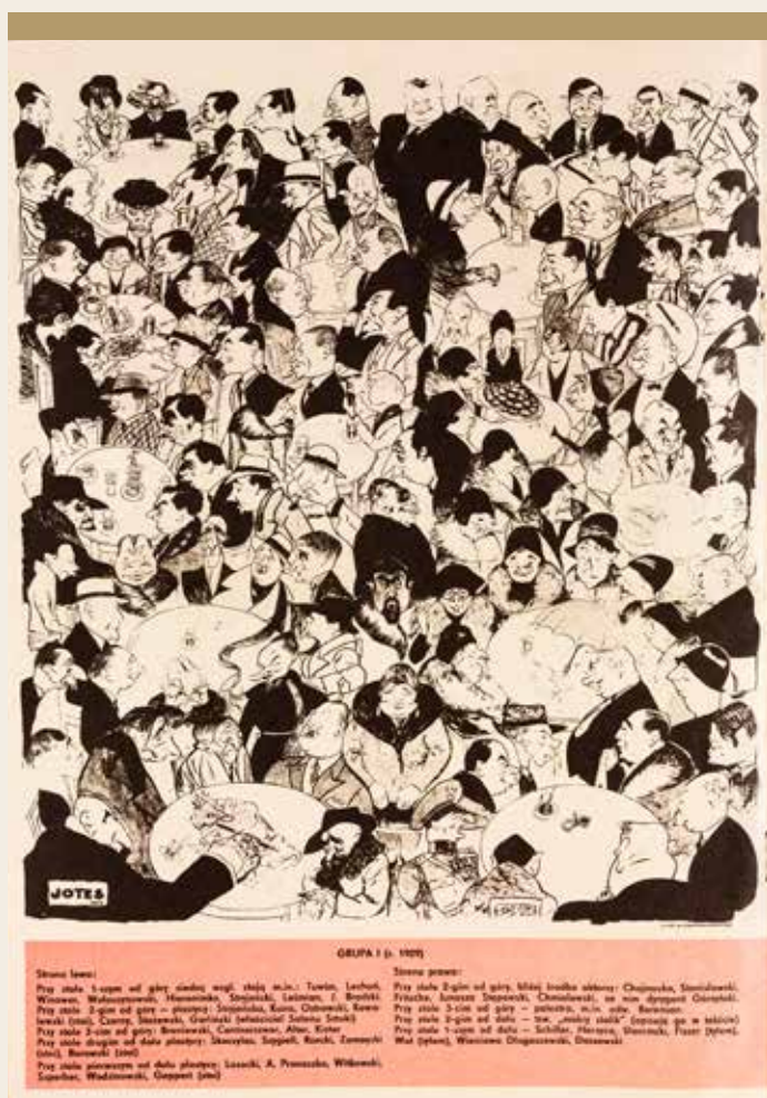
Illustration by Jerzy Szwajcer of Jewish artists at Little Ziemiańska cafe in 1930s Warsaw.

Not so long ago people who looked for books on pre-war Polish Jews could choose from such titles as On the Edge of Destruction by Celia Stopnicka Heller, No Way Out (English Title) by Emanuel Meltzer, or Oyfn Rand fun Opgrunt ( On the Edge of the Abyss ) by Jacob Leshchinsky. There was also the 1966 film entitled The Last Chapter . It is not my intention to denigrate these valuable projects but there's no denying the message that these titles convey.