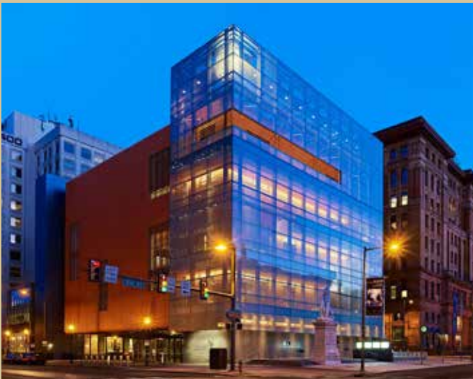
National Museum of American Jewish History, located on the Independence Mall in Philadelphia.