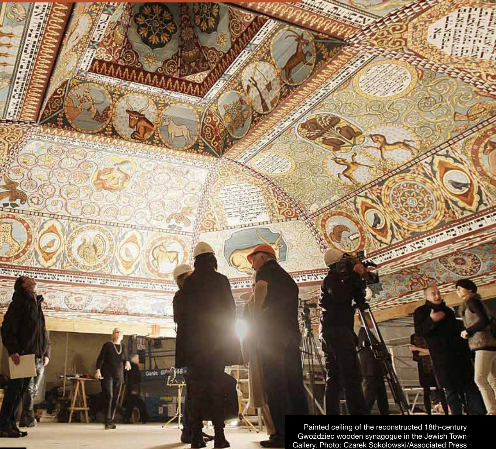
Painted ceiling of the reconstructed 18th-century Gwoździec wooden synagogue in the Jewish Town Gallery.