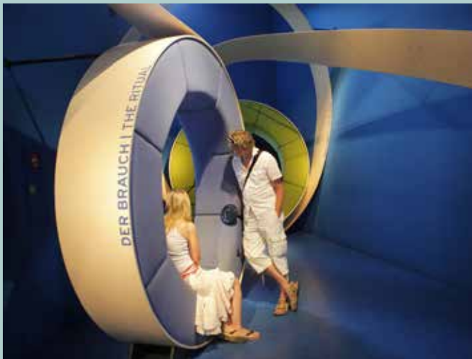
Animated films on questions of belief.

As time goes on, we can observe a slight shift of public attention away from the interest in the Nazi period and the debates about guilt and responsibility for the Holocaust. After the unification of the two German states 25 years ago, a new national self-understanding continues to slowly grow. Imperceptibly, Germany accepted the role of being a major political power in Europe, governing European politics, and determining the guidelines of solving global economic and social problems such as the international refugee issue. The postwar period in Germany is ultimately coming to an end. And with the end of this era, the "historicization" of the Nazi period and the Holocaust seeks completion in national discourse: Germany accepts