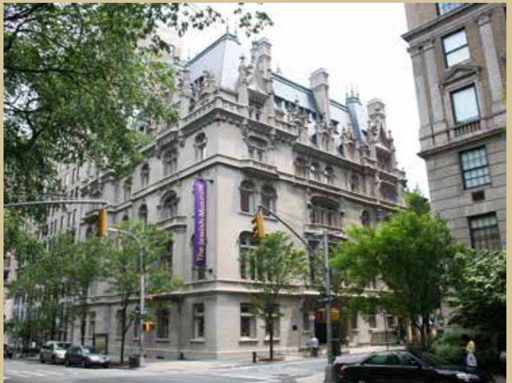
Jewish Museum, New York, housed in the former Felix M. Warburg mansion on Fifth Avenue.