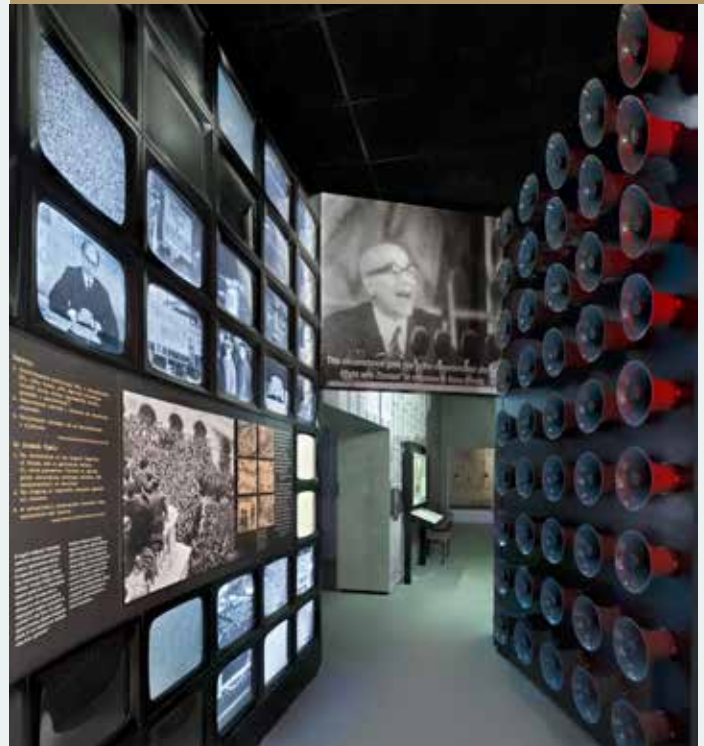
During the March 1968 antisemitic campaign, the state used television as a powerful propaganda tool.

Certainly the museum building, the core exhibition and its impressive catalogue, and the temporary exhibitions are receiving worldwide acclaim. An important program in international academic cooperation, inaugurated at the time of the museum's grand opening, is the Global Educational Outreach Program (GEOP), an ambitious program aimed both at encouraging Polish-Jewish studies and Jewish museum studies internationally at the university level and at making the history of Polish Jews better known to the next generation, in Poland and in the wider world. GEOP offers research fellowships for doctoral students and junior faculty, doctoral seminars, visiting lectureships, conferences, workshops, and internships for undergraduates. Through GEOP, the museum is establishing closer ties with other university centers engaged in Jewish studies, above all with the Jewish Historical Institute (JHI) in Warsaw, which also has an extensive and important archive. There is another complementarity between the museum and the JHI. The Institute has a large collection of artifacts and art works but few places to display them, whereas the opposite is the case with the museum.