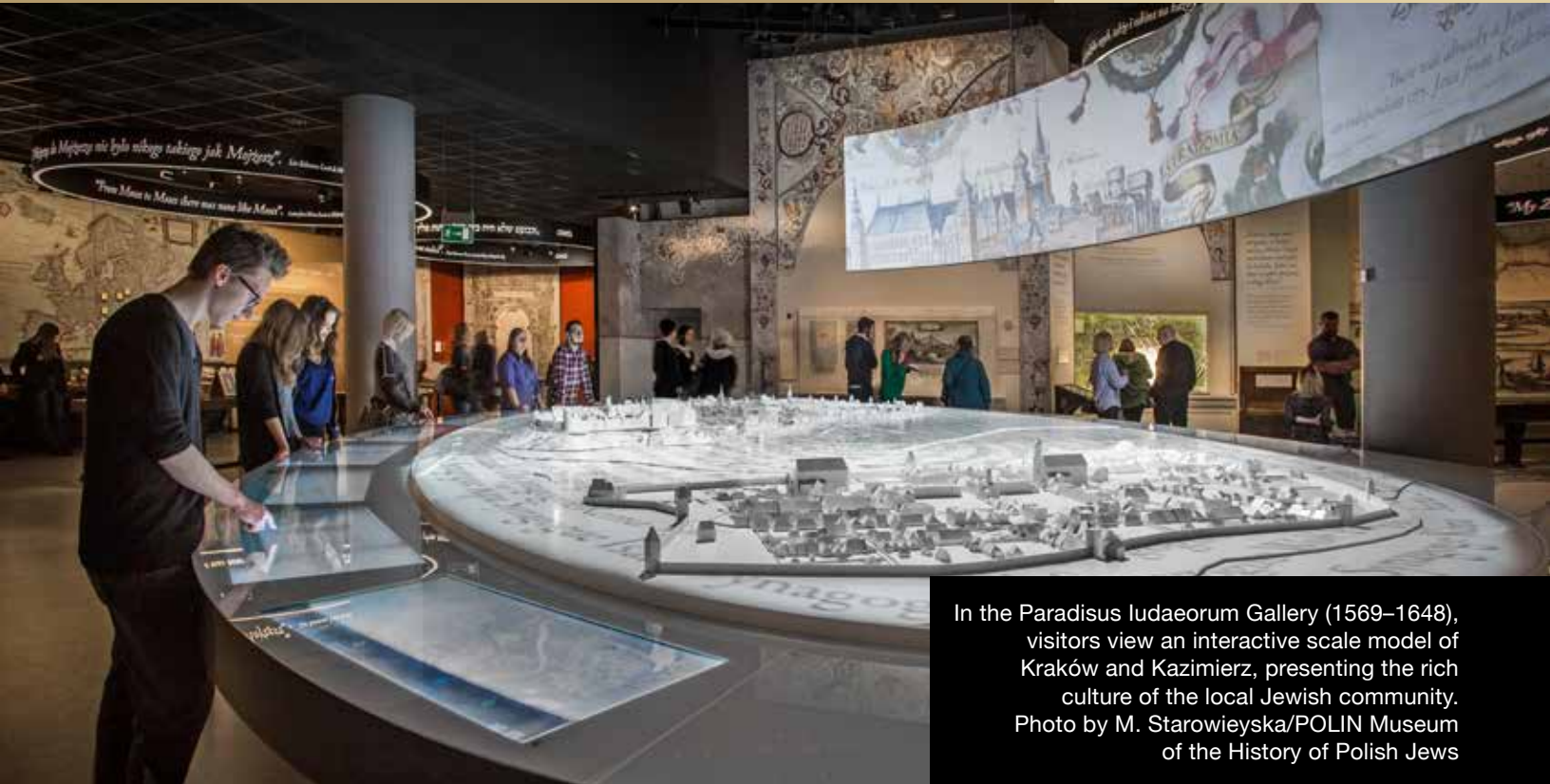
In the Paradisus Iudaeorum Gallery (1569–1648), visitors view an interactive scale model of Kraków and Kazimierz, presenting the rich culture of the local Jewish community.

Barbara Kirshenblatt-Gimblett POLIN Museum of the History of Polish Jews