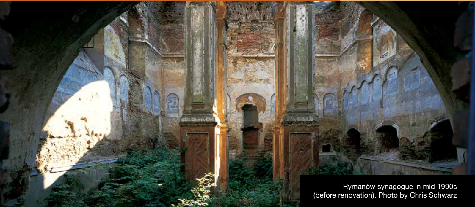
Rymanów synagogue in mid 1990s (before renovation).

The Galicia Jewish Museum is a small, private institution located in a prewar vernacular building in the Kazimierz district of Kraków. It opened in 2004 on a shoestring budget. It consists of a core photographic exhibition, as well as space for two temporary exhibitions, an education room, a café, and a large bookstore specializing in books on Jewish subjects and the Holocaust. The late British photographer Chris Schwarz and I co-curated the core photographic exhibition, called “Traces of Memory,” and published a companion volume. 1 It is not at all an exhibition of Polish Jewish history arranged chronologically. There are no