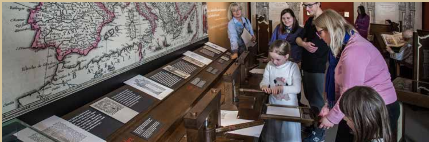
At a display of Jewish publishing houses in 16th-century Poland, visitors interact with the era's printing technology.

Our approach to this thousand-year period is chronothematic. In other words, while the exhibition is divided into periods, the historical narration proceeds not only chronologically, but above all thematically.