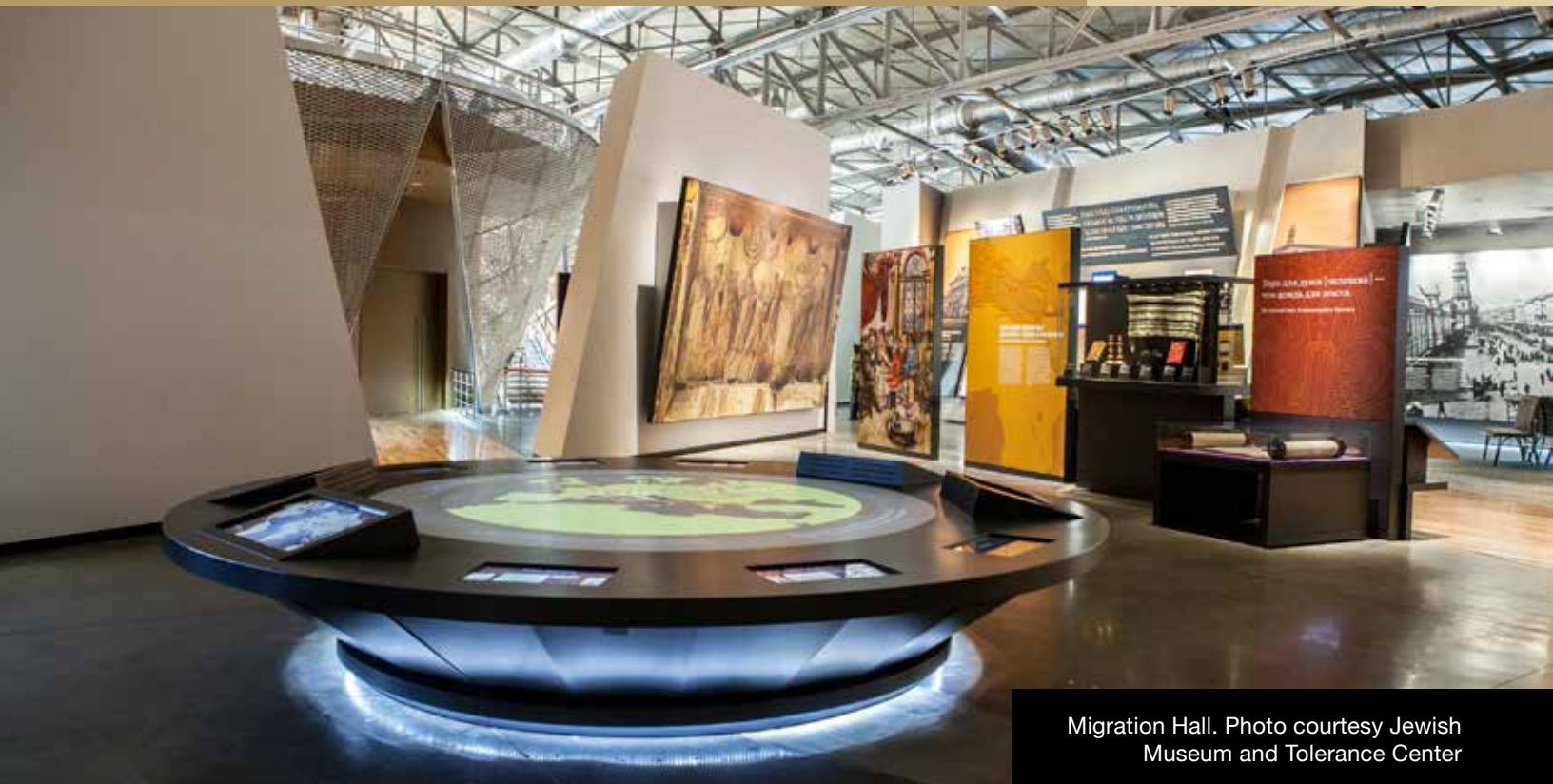
Migration Hall.

Uri Gershowitz Jewish Museum and Tolerance Center in Moscow