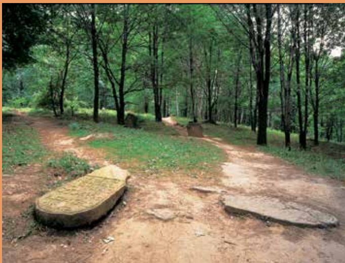
Lesko cemetery.

the territory of Galicia was incorporated into the newly independent Polish Republic. After the upheavals of World War II, the boundaries were changed once again. The territory of old Galicia was divided in half: what had once been eastern Galicia was annexed by the Soviet Union and eventually became part of Ukraine (as it is to this day); Poland kept only the western half. But the memory of Galicia remains very strong, both among local people and also among the descendants of Jews who were born there. The most important town of western Galicia was in Kraków, and this is why we have our exhibition here.