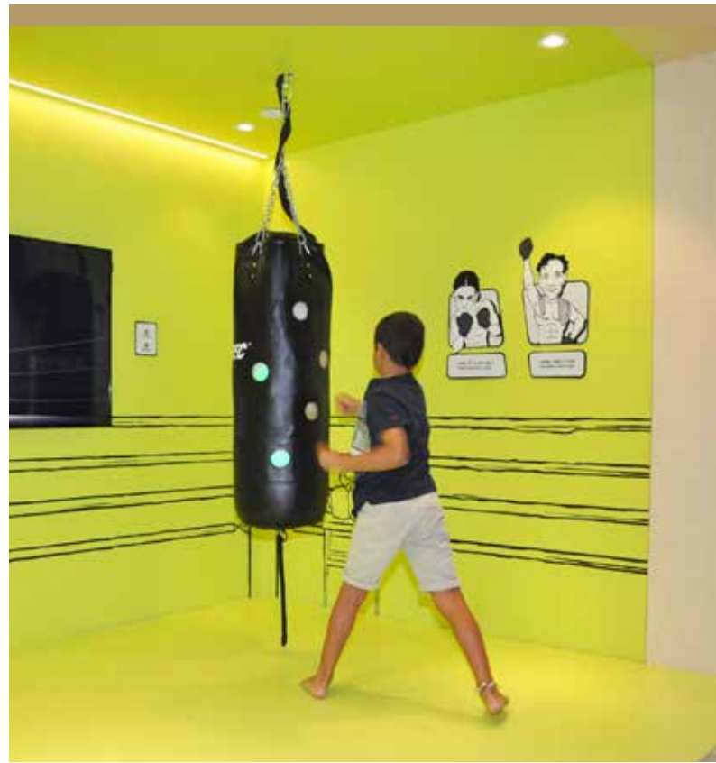
From the exhibition “Heroes — Trailblazers of the Jewish People” at Beit Hatfutsot, The Museum of the Jewish People.

How much more imaginative and interactive might a museum caption be if, instead of merely providing a description, it raised difficult questions for the visitor as well. Alongside an elaborate pair of silver candlesticks, curators might ask: Must form follow function in the creation of Jewish ritual objects? Is it appropriate to have such ostentatious display in the service of piety? Who could afford such an expensive ritual object? And how much more compelling would the distinctive nature of Jewish culture be if it were juxtaposed against artifacts from other cultures in a comparative frame, rather than being surrounded almost exclusively by other self-referential Jewish objects?