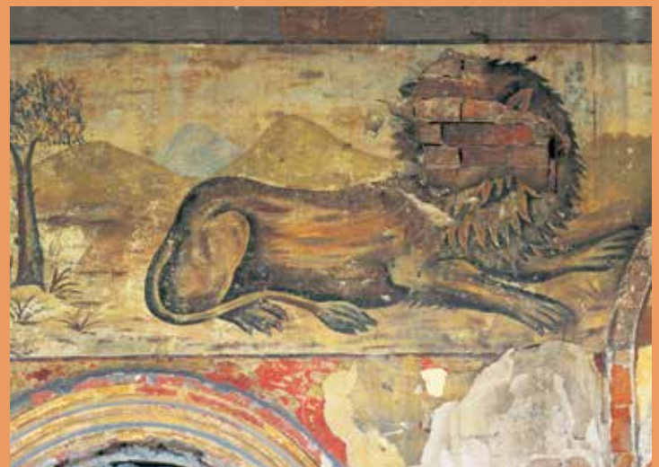
Synagogue wall, pre-renovation, Dąbrowa Tarnowska.

Polish Jews in Poland as well as historical moments of anti-Jewish violence — in that way highlighting the contradictions to be found in the history. On the other hand, one advantage to the present-day orientation was that it allowed me to showcase and take issue as necessary with the stereotypes which persist in simplified, mythologized and subjective memories of the past, and which continue to influence (and sometimes obscure) an understanding of today’s realities.