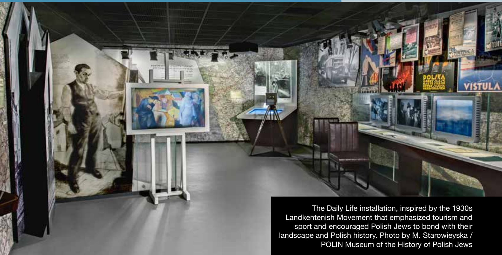
The Daily Life installation, inspired by the 1930s Landkentenish Movement that emphasized tourism and sport and encouraged Polish Jews to bond with their landscape and Polish history.

Samuel D. Kassow POLIN Museum of the History of Polish Jews