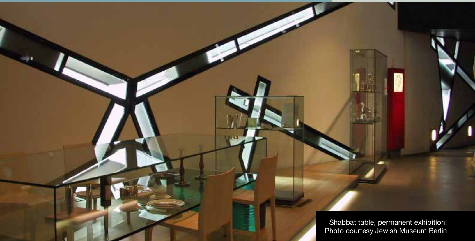
Shabbat table, permanent exhibition.

Jewish museums can be very different in orientation, message, and outlook, depending on the national context. They can be community-engaged museums, as are many in the United States, or Great Britain, or they can be entire city quarters, as in Prague. More common are specialized local history museums or Holocaust museums that are taken for “Jewish museums,” thereby conflating “Jewishness” with the Holocaust and nothing more. In this landscape, the Jewish Museum Berlin defines itself as a German history museum with a special focus on the Jewish minority in Germany from late antiquity to today. As part cultural atonement, the Jewish Museum Berlin serves a political and educational function in Germany’s postwar effort to come to terms with its Nazi past.