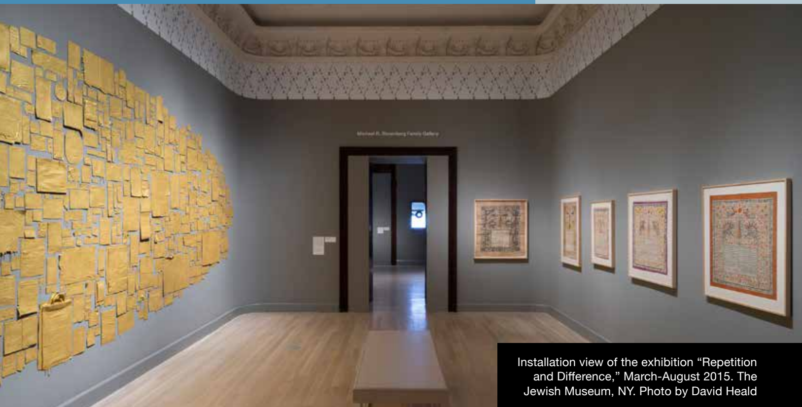
Installation view of the exhibition "Repetition and Difference," March-August 2015. The Jewish Museum, NY.

Susan L. Braunstein The Jewish Museum, New York