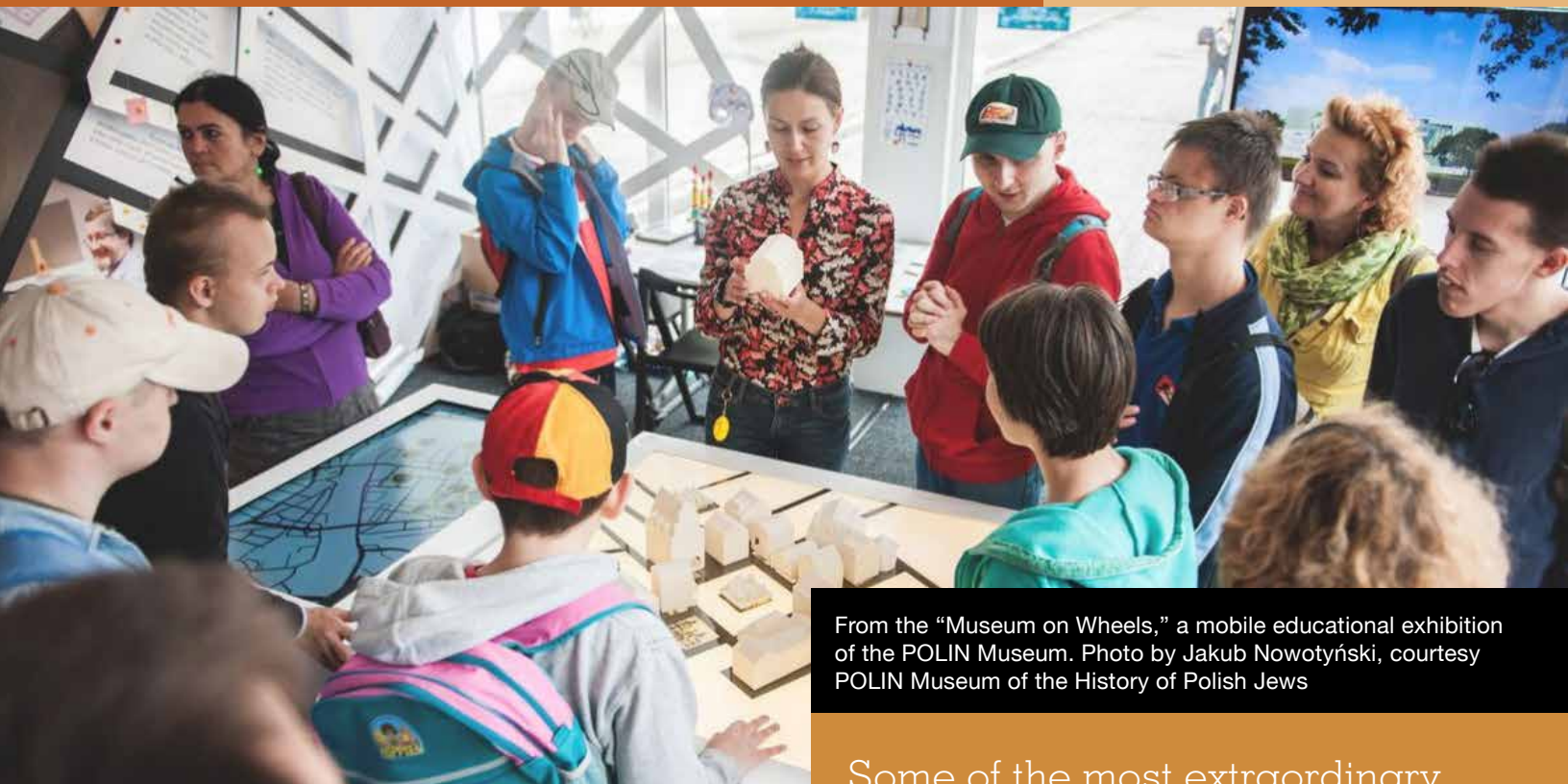
From the “Museum on Wheels,” a mobile educational exhibition of the POLIN Museum.