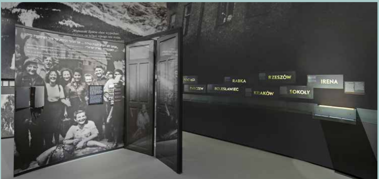
At the left, a gathering of Zionist youth living in a kibbutz in Kielce who were among the victims in the July 1946 pogrom. At the right, the names of other sites of postwar pogroms.

In Poland, since the end of Communism, museums have changed greatly, reflecting the debates in the country over identity and Poland's desire to be part of an integrated Europe. The display in the state museum at Auschwitz has been revamped and a new memorial has been created at Bełżec. An Auschwitz Jewish Center, containing both a museum and a synagogue, has been established in the town of Oświęcim, while Kraków is the home of the history museum created in the former offices of Oskar Schindler's enamelware factory and of the photography-based Galicia Jewish Museum. There