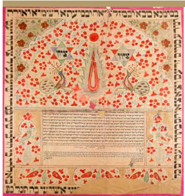
Marriage contract, Isfahan Iran Persia, 1330. The Jewish Museum, NY.

Another exhibition that placed Judaica in a new interpretive context was “Repetition and Difference” (2015). It featured multiple examples of nearly identical collections displayed together with contemporary art. The exhibition explored how repetition in art, traditionally