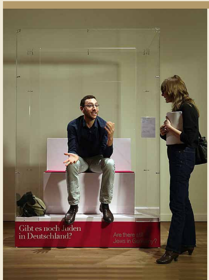
"The Whole Truth ..." Exhibition at the Jewish Museum Berlin, 2013, in which volunteers from the Jewish community sat in a transparent box to answer questions about Jews and Judaism.

As Jewish museums have proliferated, so has the Jewish museum effect. To some extent, this reflects broader trends in museum practices. For example, many museums invite interactive engagement with exhibitions, eliciting responses or materials from visitors that then become part of the installation. An exhibition in the Jewish Museum of Australia in Melbourne on the history of Australian Jewry explains when Jews immigrated there and invites visitors to write about their own families' immigration histories on paper tags, which are then put on display. These accounts situate Jewish stories within Australia's ongoing history of immigration and demonstrate the museum's significance for a diversity of non-Jewish visitors. The act of writing and displaying their personal information also implicitly positions visitors within Australian Jewish history, as their stories of origin implicitly become Jewish museum artifacts.