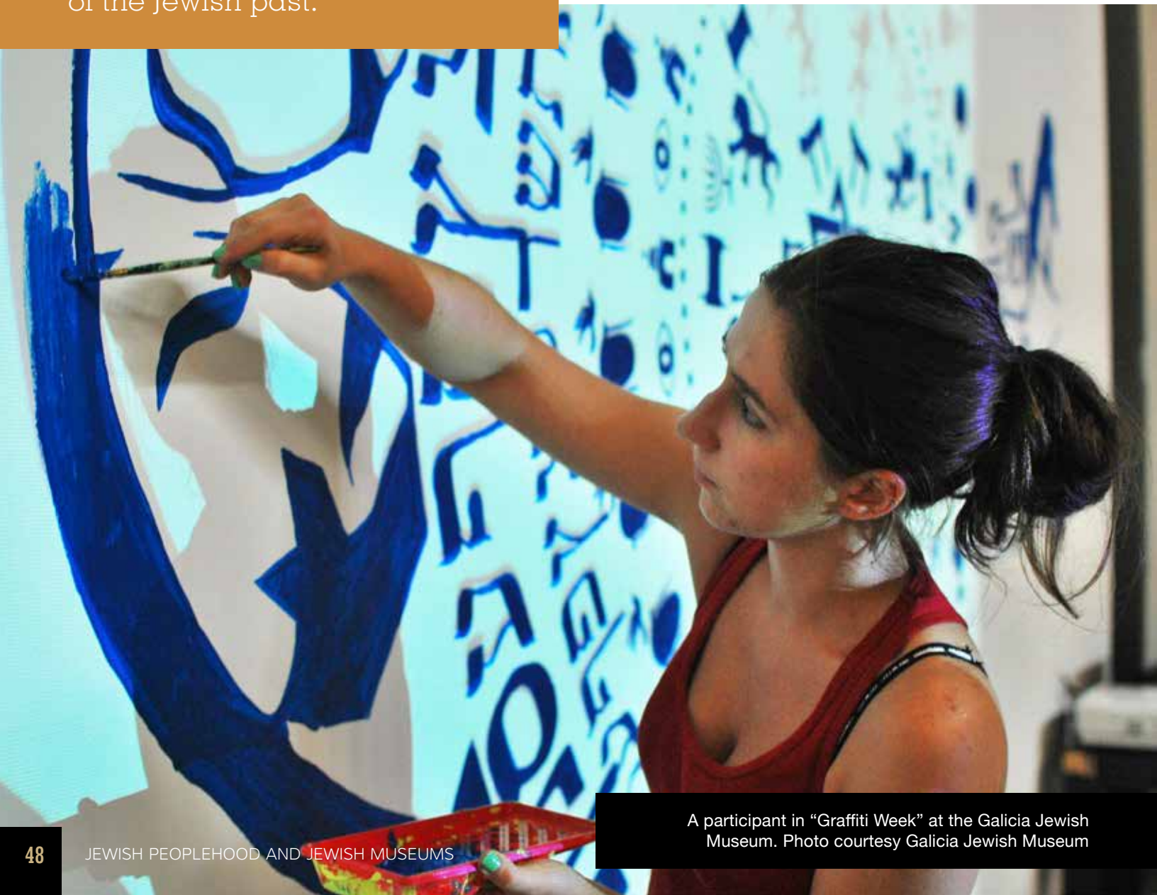
A participant in “Graffiti Week” at the Galicia Jewish Museum.