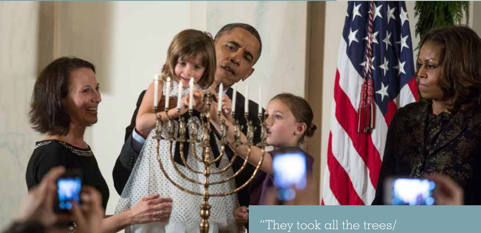
President Obama helping light the Hanukkah menorah in the White House, December 2013.

Ivy Barsky National Museum of American Jewish History