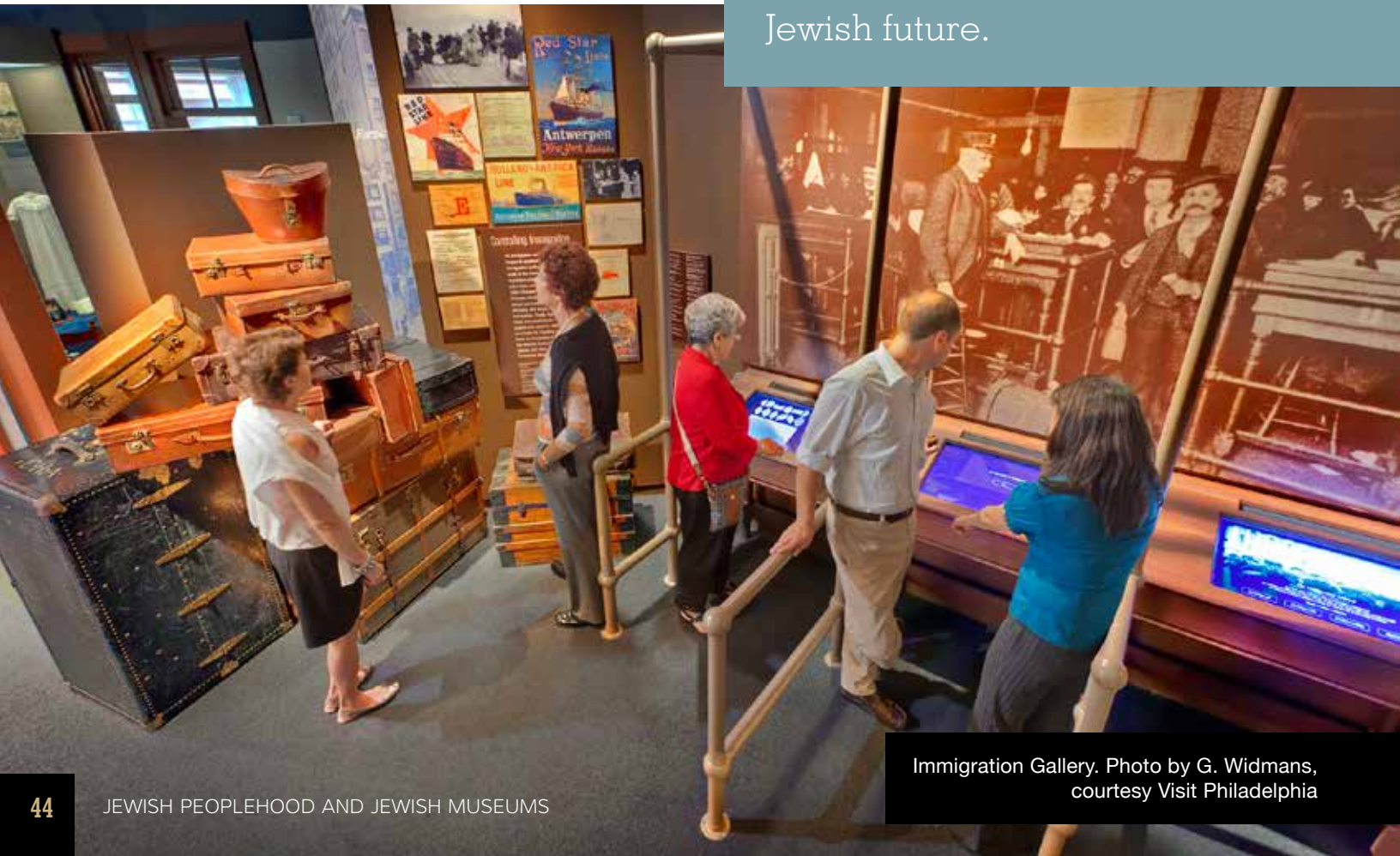
Immigration Gallery.

But we are an essential part of the ecology of Jewish history and identity. Most of all, we are an important part of a vibrant Jewish future.