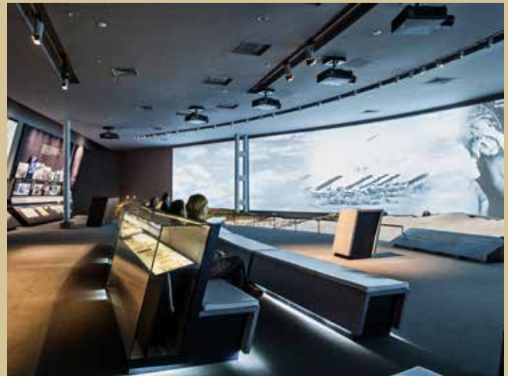
World War II Hall, with filmed commentaries of war survivors.

itself as an influential religious organization dedicated to Orthodox Judaism. From the perspective of the religious Jewish community, what role exactly is the museum intended to fulfill? Why does the community need the museum? The answers to these questions are complex and bipartite.