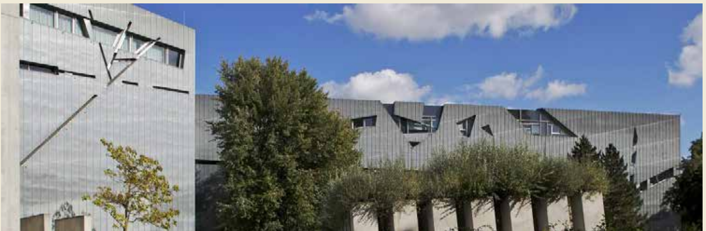
A view of the Jewish Museum Berlin, designed by architect Daniel Libeskind.

Kugelman, who places the museum in the forefront of the future, captures the tenor of her colleagues. The curatorial mission is an encounter with the past for today and tomorrow. The past is both instrumental and absolute. The museum will both illuminate and educate. It will also shape a collective narrative of many parts. The eleven pieces in the collection suggest the vibrancy and diversity of a modern Jewish exploration of a worldwide peoplehood in the 21st century. ■