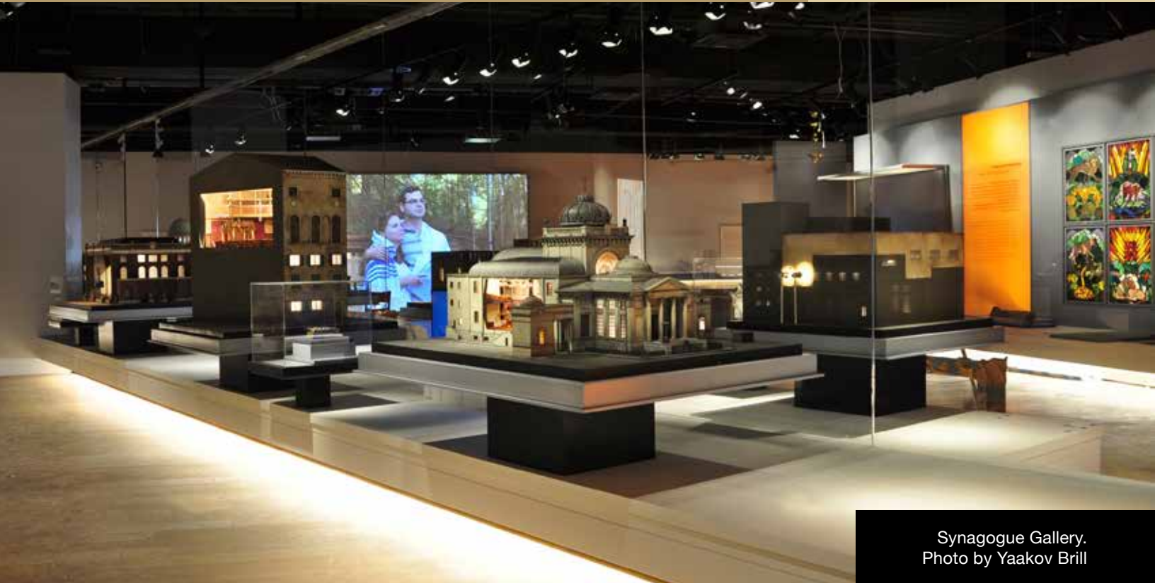
Synagogue Gallery.

Irina Nevzlin Beit Hatfutsot, The Museum of the Jewish People