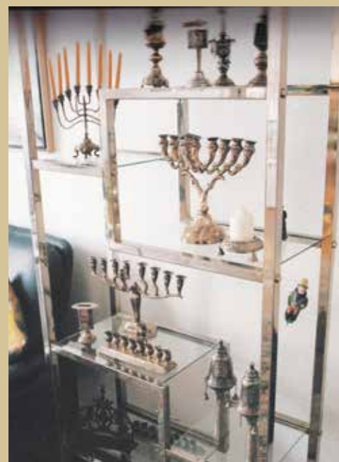
Judaica displayed in private homes as a domesticated museum practice; in the SF Bay Area, left, and in Frankfurt, right.

is anyway a bit like living in a box ... your mere presence in a pub triggers debates about the Holocaust or Middle East politics — so I wasn’t fazed about taking part [in the exhibition].” 1