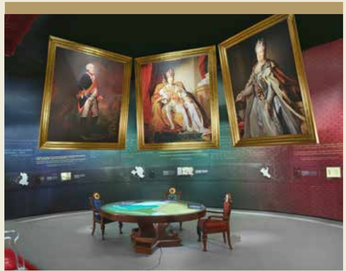
View of the Royal Cake installation in the Encounters with Modernity Gallery (1772-1914).

Perhaps the most dramatic examples are the magnificent wooden synagogues, created in the 17th and 18th centuries, none of which exist today. In collaboration with Handshouse Studio, hundreds of volunteers and