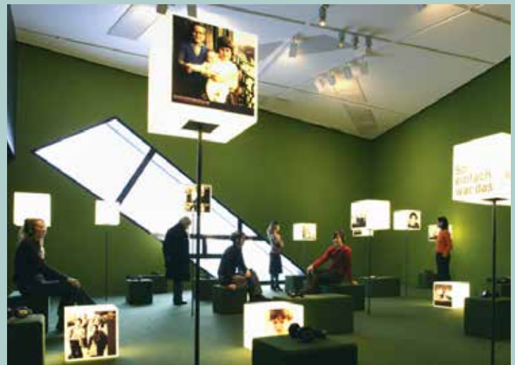
Audio takes: selected voices of how to grow up as a Jew in Germany.

and Judaism as a distinct development in a process of increasing abandonment of Jewish particularity in favor of participation and involvement as Germans into German society. A new permanent exhibition, which will open in 2019, will shift the emphasis to the historical interaction of Jews and Christians, particularly Jewish Germans and Christian Germans who influenced each other in varying degrees. In Germany, Jewish museums were perceived as a public expression of troublesome retrospections, which were based on painful arguments between perpetrators and victims with the aim to find a cooperative consensus. Jewish history exhibitions in Germany therefore remain closely linked with questions of general memorial policies and the actual historical-political discourse.