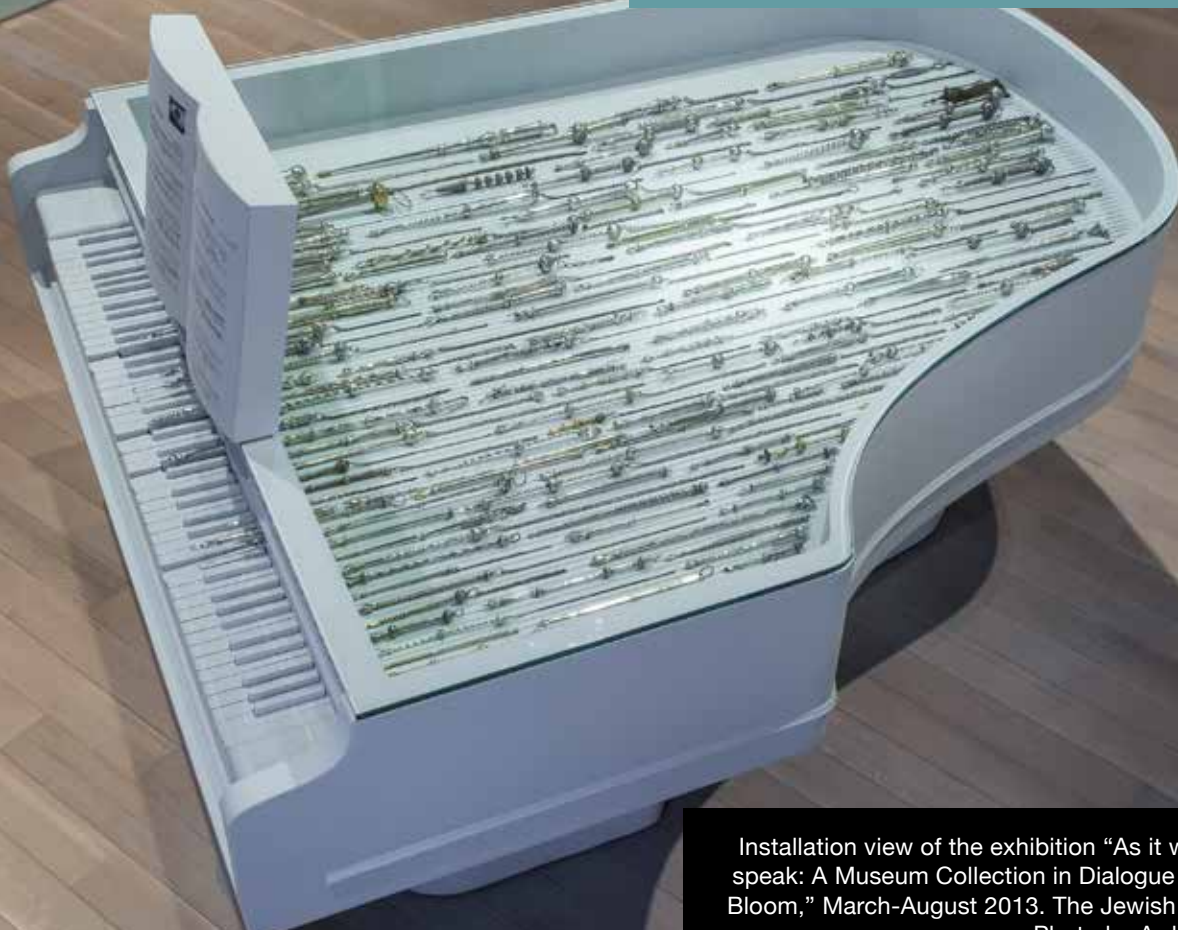
Installation view of the exhibition "As it were . . . So to speak: A Museum Collection in Dialogue with Barbara Bloom," March-August 2013. The Jewish Museum NY.

Exhibitions are not the only means by which the museum strives to create relevance and contemporaneity with its collection.