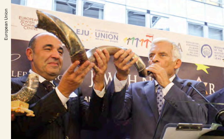
Jerzy Buzek, Polish President of the European Parliament, blows the shofar in front of a crowd of over 600 at a special Rosh Hashanah celebration.

The event was co-organized by the European Jewish Community Centre, the European Jewish Union and European Jewish Public Affairs.