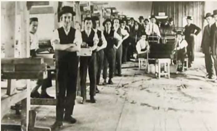
Łódź factories were emblematic of the industrialization of the region in the 19th century and will be a feature of the Encounters with Modernity Gallery.