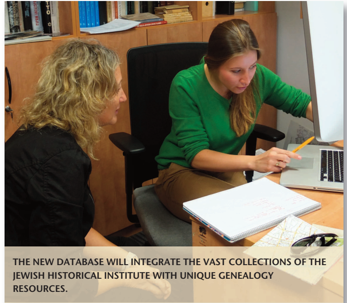
THE NEW DATABASE WILL INTEGRATE THE VAST COLLECTIONS OF THE JEWISH HISTORICAL INSTITUTE WITH UNIQUE GENEALOGY RESOURCES.

Finally, the interactivity of the web presence will help the Genealogy Center to serve more people more efficiently. By enabling visitors to explore the archives online, it will permit us to spend our (very finite) time on the most specialized and challenging searches.