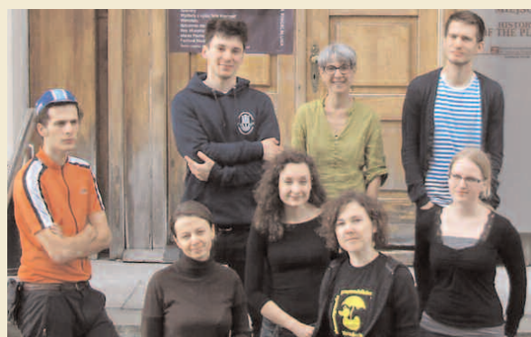
THE JEWISH GENEALOGY & FAMILY HERITAGE CENTER AND TAUBE JEWISH HERITAGE TOURS PARTNER TO OFFER FAMILY HERITAGE TOURS AND VISITS IN WHAT WAS ONCE GREATER POLAND.

THE TAUBE JEWISH HERITAGE TOUR PROGRAM offers tailor-made study tours for individuals, families and groups from around the world seeking to discover their personal histories, explore a collective past and participate in the continuing revival of Jewish life in Poland. The tours integrate sites of Polish Jewish heritage and memory with visits to family homes and to Jewish institutions, and include special sessions and meetings with individuals dedicated to Jewish heritage preservation and those contributing to contemporary Polish Jewish life and culture.