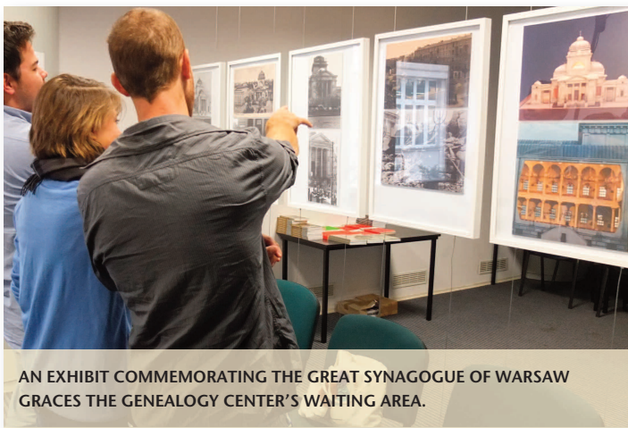
AN EXHIBIT COMMEMORATING THE GREAT SYNAGOGUE OF WARSAW GRACES THE GENEALOGY CENTER'S WAITING AREA.

The Genealogy Center is located on the former site of the Great Synagogue of Warsaw, destroyed by the Germans in 1943. It was once the second largest synagogue in Europe and could seat some 2,200 worshippers. In homage to the institution that once stood on the site, the Genealogy Center has joined a collaborative project to commemorate the synagogue in a seven-minute film featuring a woman who attended it. The exhibit and film now grace the Genealogy Center's waiting area and have been drawing much comment. More components are being planned.