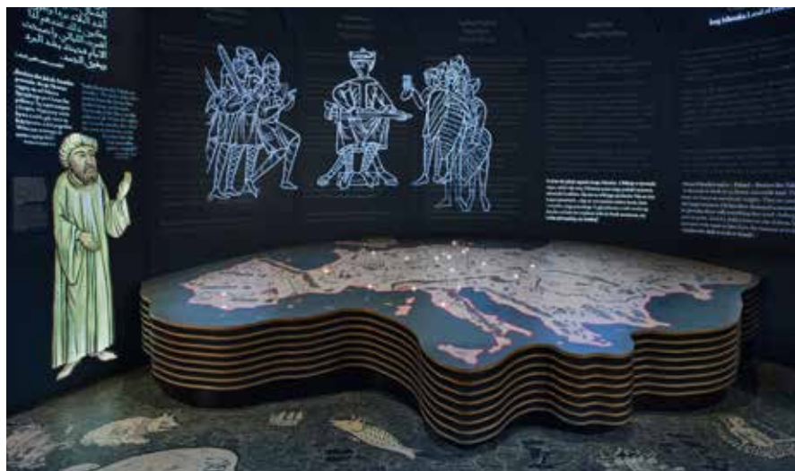
First Encounters Gallery of POLIN Museum of the History of Polish Jews