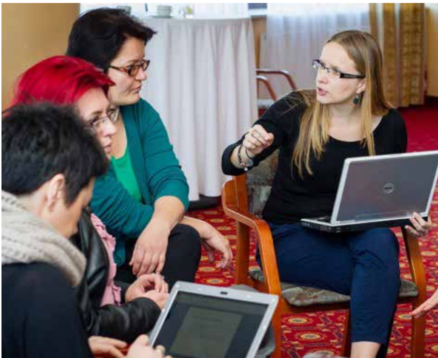
CENTROPA Workshop, photo: CENTROPA

The CENTROPA Summer Academy will also spend a