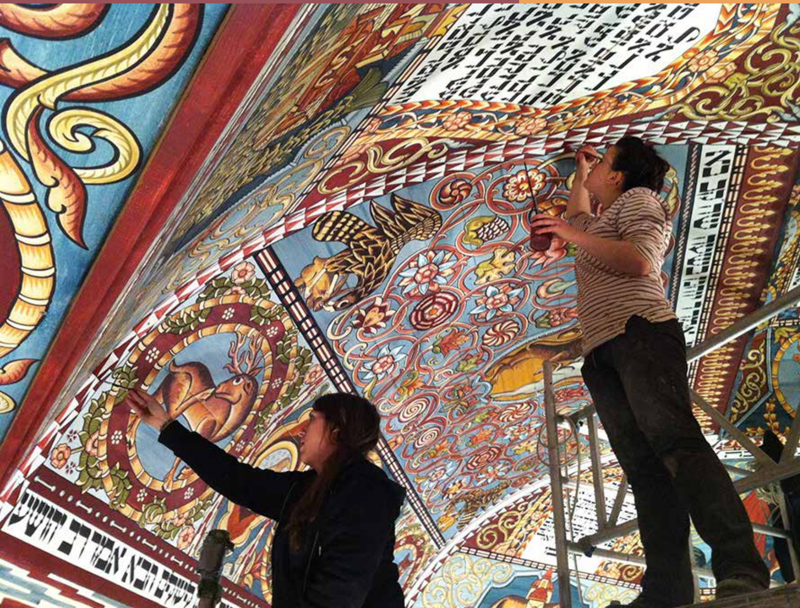
Volunteers painting the elaborate ceiling of a close-to-scale replica of the Gwoździec Synagogue

may come from families who converted to Christianity several generations ago or who hid their Jewish origins from their children. Many people expect the exhibition to celebrate the contributions of Polish Jews, broadly defined, to Poland and the world – in medicine, science, law and politics, in Hollywood, and