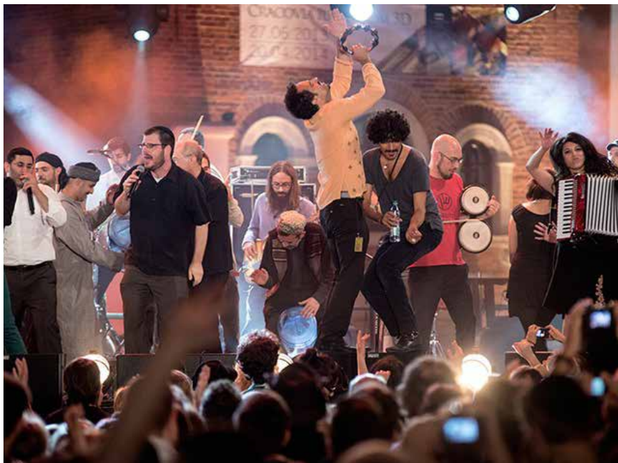
Shalom on Szeroka, the final concert of the week-long Jewish Culture Festival

Each of the past 24 Festivals has built upon the success of the previous year's Festival. Reaching the 25th anniversary gives us an opportunity to reflect on our Festival's achievements and sustainability. We decided