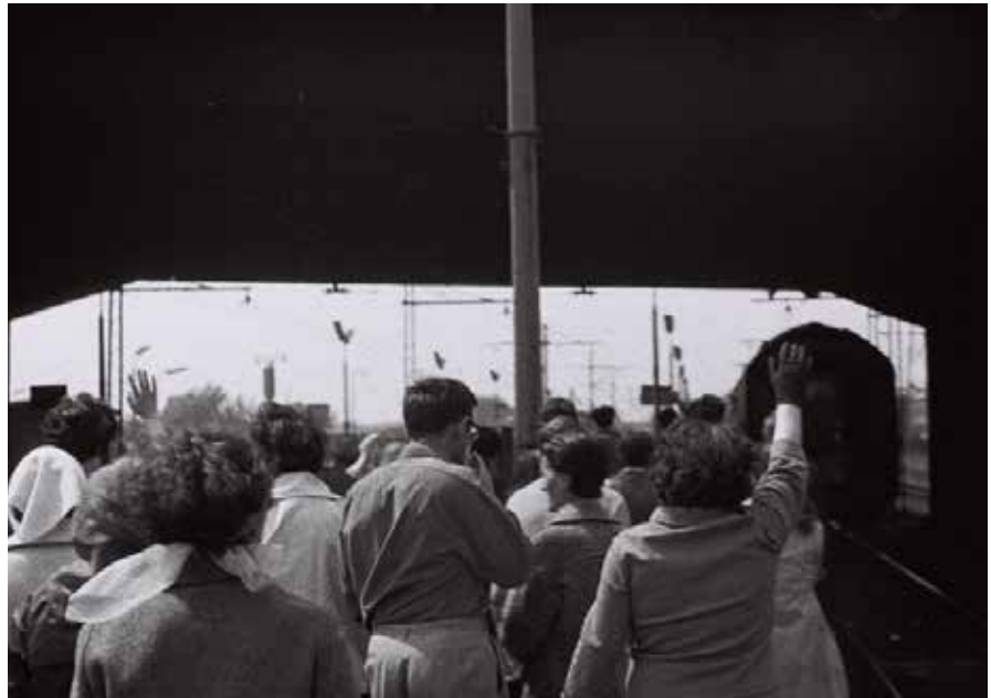
Farewell to Gdańsk Station

Some of the Jews born after WWII undertook to give new meaning to their Jewish origins. Starting in the late 1970s they created their own identity, ab initio as it were, learning the history and customs of the