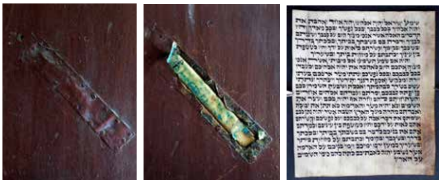
Mezuzah scroll discovered by Mi Polin in Przemyśl