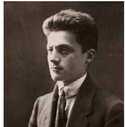
Emanuel Ringelblum