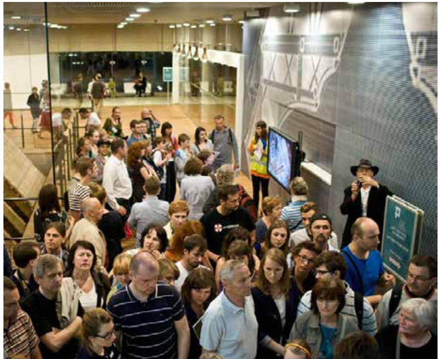
Group Tour of POLIN Museum

The Global Education Outreach Program (GEOP) aims to transmit the POLIN Museum's educational message and unique resources