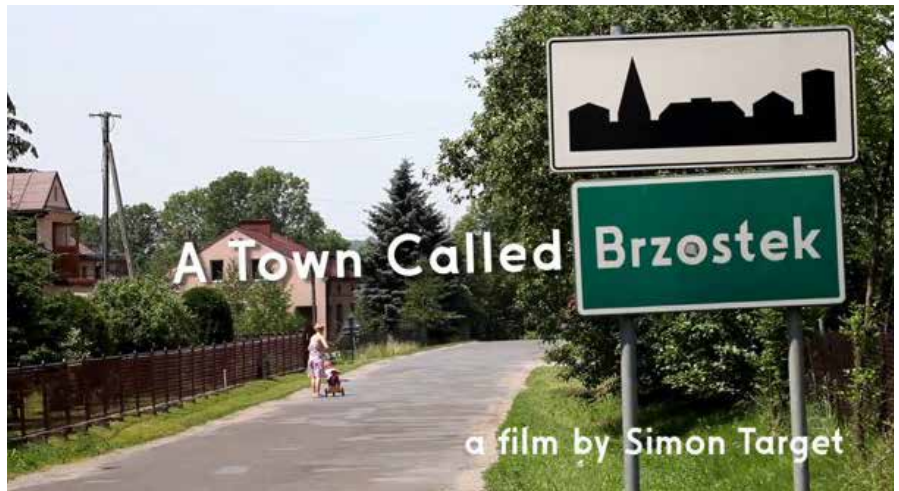
A Town Called Brzostek