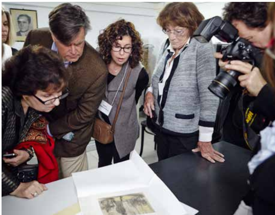
Group viewing of Ringelblum archive artifacts

The JHI's most treasured collection is the Emanuel Ringelblum Archives. Ringelblum, a historian, organized a clandestine network of writers, journalists, historians and artists in the Warsaw Ghetto, called Oyneg Shabes , to document Jewish life and death during