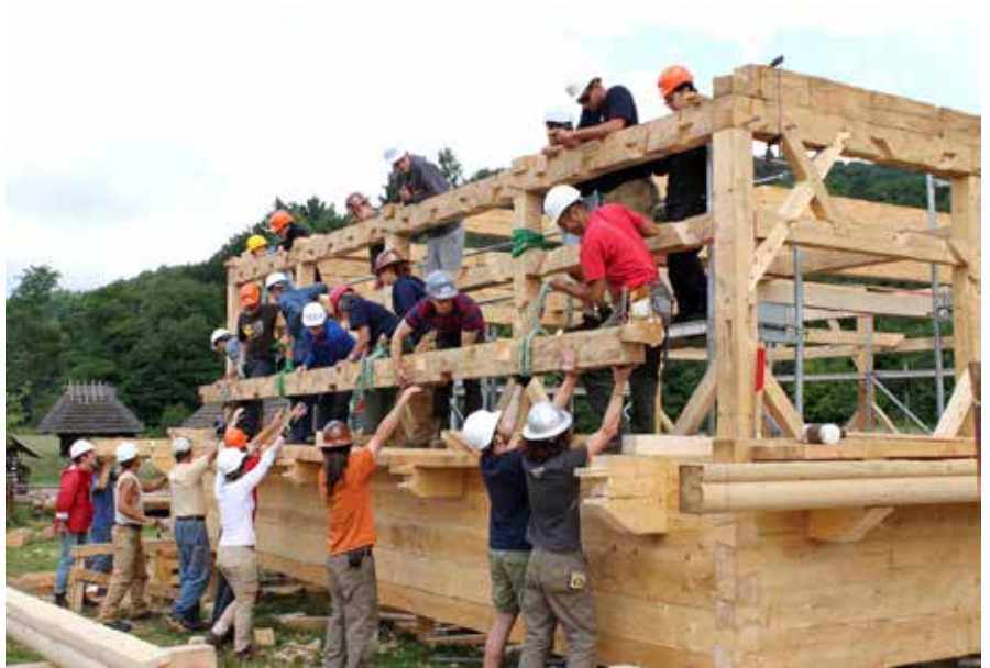
Volunteers work on the Gwoździec Synagogue Project in Sanok, Poland.

Raise The Roof follows the Browns and the Handhouse Studio team to Sanok, Poland, as they begin building the new Gwoździec roof. The crew has only six weeks to hew, saw, and carve 200 freshly logged trees and assemble the structure. Working against a seemingly impossible deadline and despite torrential downpours and exhaustion, the team must create the structure, and disassemble it again for shipping and eventual installation.