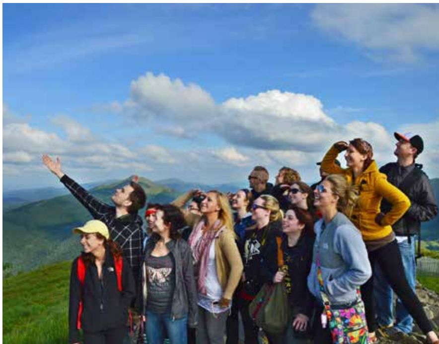
Participants in the inaugural summer program, “Towards a 21st Century Polonia: Explore, Connect, Get Involved” (Summer 2014)

Deadline for application is April 15, 2015. Almost all expenses per student are covered by the grant, excluding international airfare, travel insurance, and personal expenses. Please share this announcement with students and friends. ■