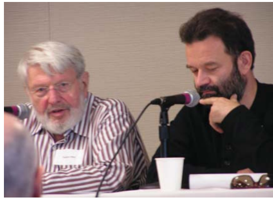
Theodore Bikel and Janusz Makuch discuss "Jewish Cultural Renewal: Reflections from Europe & the U.S."