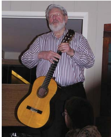
Theodore Bikel performs for a delighted gathering.