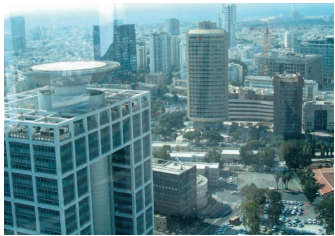
The modern city of Tel Aviv.

A new initiative has recently been launched which creates a partnership with the Overseas Pri-