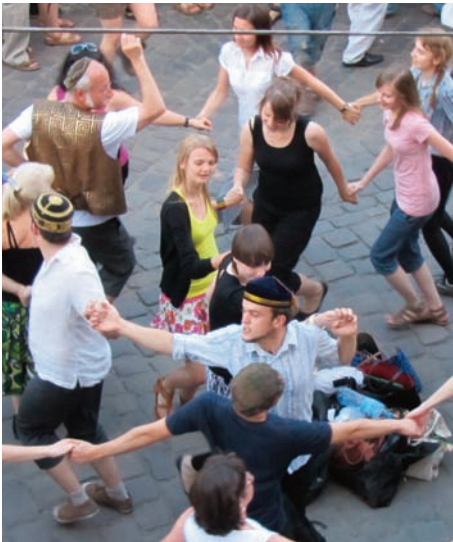
Right, the closing night concert of the Jewish Culture Festival in Krakow draws thousands, with dancing in the streets, above, a common sight.

U.S. Secretary of State Clinton, whom we had the honor of meeting at a press conference in Krakow’s new Oskar Schindler Museum, announced a $15 mil-