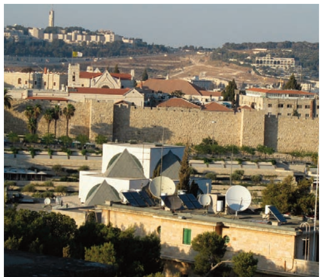
The Old City of Jerusalem.