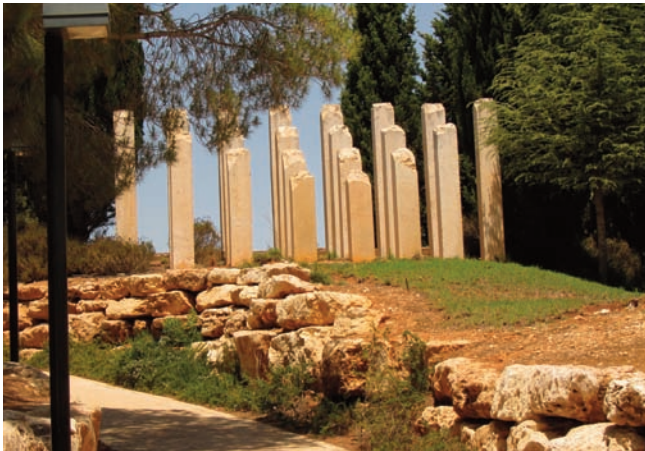
Memorial site at Yad Vashem.