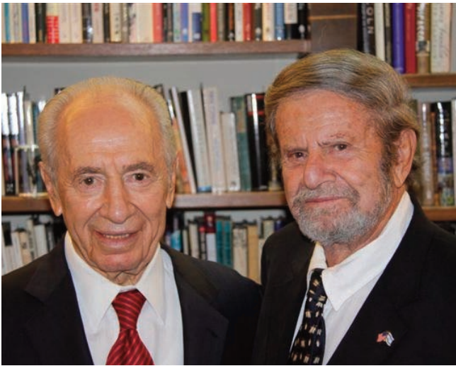
President of Israel Shimon Peres with Tad Taube.