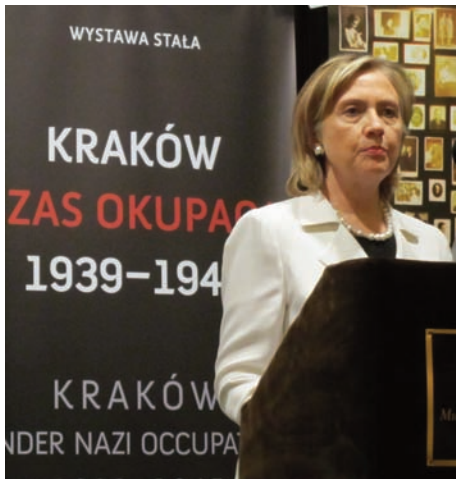
In Krakow, U.S. Secretary of State Hillary Clinton announces a $15 million Congressional allocation to preserve Auschwitz-Birkenau.

grimage to Warsaw and Krakow took place from June 29-July 4.