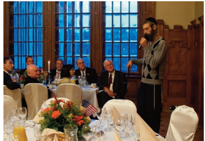
World-renowned American reggae musician Matisyahu performs a Fourth of July tribute.