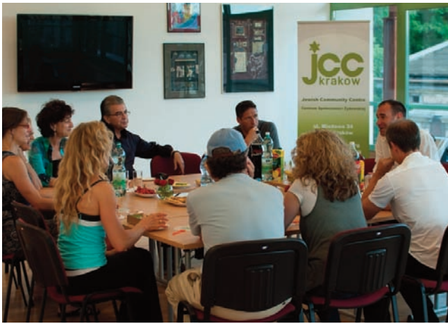
At the Jewish Community Center in Krakow, guests learned about its many programs.