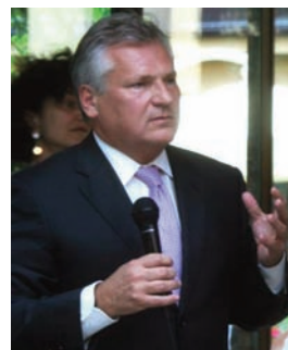
Former President of Poland Aleksander Kwasniewski giving an acceptance speech for the Taube 2010 Irena Sendler Memorial award, honoring his work in preserving Jewish heritage and fostering Jewish cultural renewal in Poland.